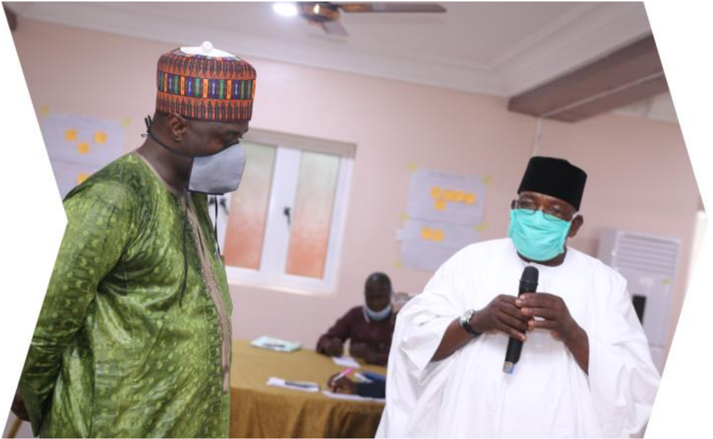
Kaduna, Nigeria