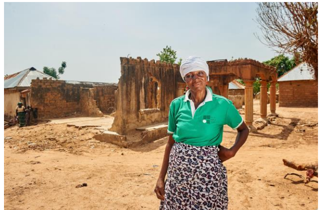
Tudun Adabu, Nigeria

Fragile social contracts are further eroding where COVID-19 is seen by local populations as an opportunity for corruption, incompetence, and exclusive or repressive behavior by governments. In some countries, the inability or unwillingness of the state to respond to citizens’ needs, and the diminishing ability of civil society to hold authorities accountable, is deepening mistrust and legitimacy gaps and weakening civic engagement—the hallmarks of governance-related drivers of conflict . Already, public demonstrations and anti-government protests, while initially declining during the onset of the pandemic, have started to rise again in some countries , often as part of a reaction to government lockdown and mitigation measures. There has also been a global increase in mob violence , particularly against state forces, since the declaration of the pandemic by the World Health Organization in March. Security forces in countries such as Kenya , Nigeria , the Philippines , Uganda , and Zimbabwe have further aggravated the situation by responding to protests with increased repression and by imposing lockdowns through force. In