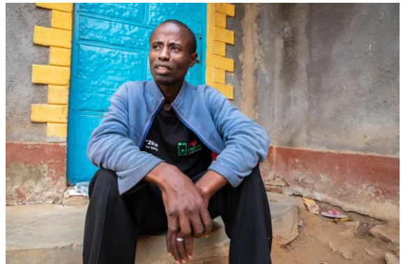
Emali, Kenya