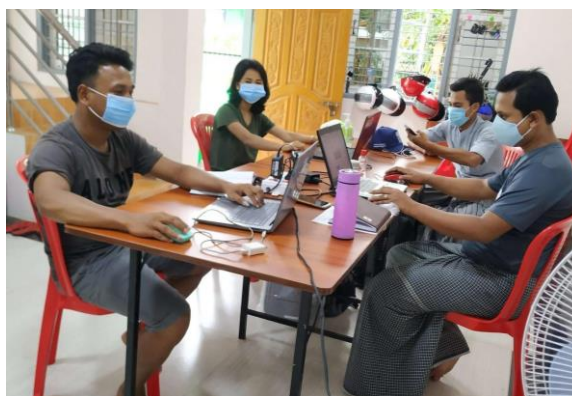
Sittwe, Myanmar

In addition to these kinds of program adaptations, simpler adjustments must be made to ensure that all peacebuilding interventions adhere to health guidance, along with thinking through smart ways to transfer interventions to a digital or mobile space in a way that fosters connections across groups. For example, in North Central Nigeria, our peacebuilding program has started to use an SMS platform to send alert messages with lifesaving information, support responders, and collect participant feedback so that people’s voices can be heard. These mobile surveys enable the team to map the escalation or triggers of violent conflict in order to deploy more targeted responses.