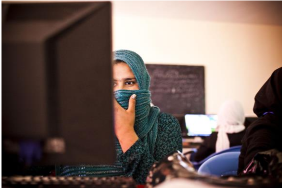
Helmand, Afghanistan

The widely discussed “infodemic”—in which people spread incorrect information unintentionally (misinformation) or intentionally (disinformation)—not only hampers public health outcomes, but also contributes to inflaming fears and misperceptions across groups, while deepening mistrust of government officials and health experts. Data collected by researchers at Princeton University indicates that COVID-19 disinformation is rife and covers a wide range of topics, from the nature and origins of the virus to unproven cures and emergency responses. Most disinformation comes from individuals —rather than states, companies, or media—some of whom pose as health officials or government representatives. The power of social media is amplified as people increasingly rely on polarized, self-isolating digital spaces to receive news and share opinions. This can contribute to conflict directly—by further stoking social tensions and anti-government hostility—and indirectly, by risking greater COVID-19 infections. During the Ebola epidemic, mortality rates were higher in countries suffering from significant misinformation because citizens were less likely to comply with public health guidelines.