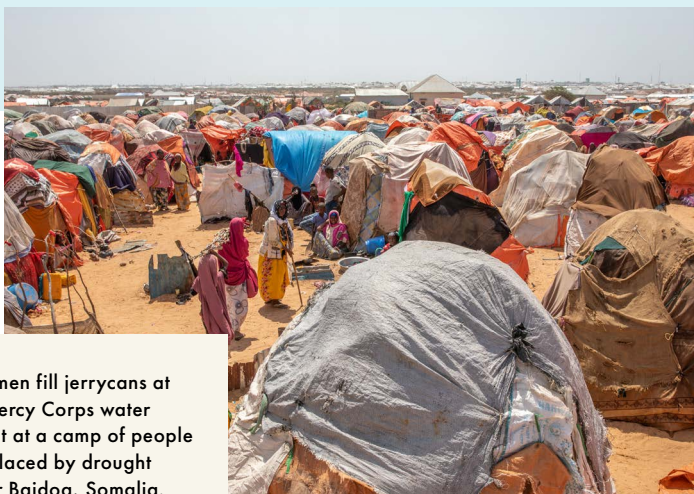
Women fill jerrycans at a Mercy Corps water point at a camp of people displaced by drought near Baidoa, Somalia. In addition, our team is distributing food, water, and hygiene kits.