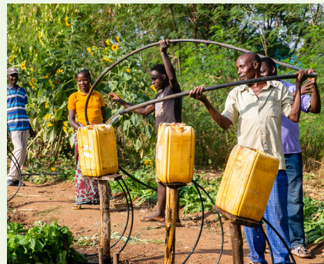
August 2023, Geita Region, Tanzania. Mercy Corps

By applying evidence-based approaches to programs and initiatives that promote solar-pumping solutions, new irrigation