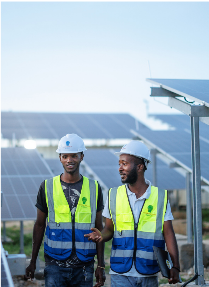
May 2024, Sheder, Ethiopia.

The impacts of climate change have reached crisis levels in much of the Global South. Climate-related disasters and dire environmental conditions are devastating communities, weakening critical infrastructure, threatening lives and livelihoods, and forcing millions to flee their homes in search of safety and better opportunities 1 .