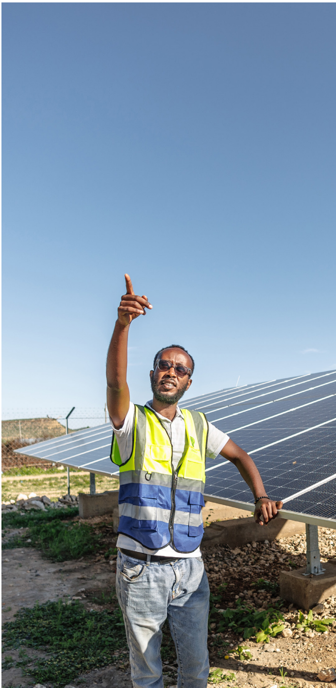
May 2024, Sheder, Ethiopia.