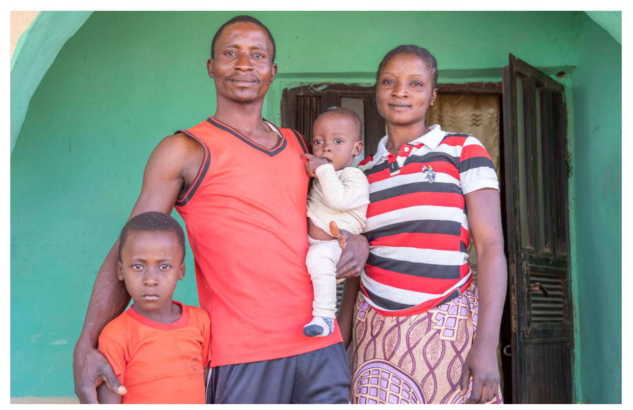
January 2024, Antiok, Nigeria.

The investments from migrants and diaspora networks help finance climate-resilient infrastructure and technology, and support local businesses that benefit their