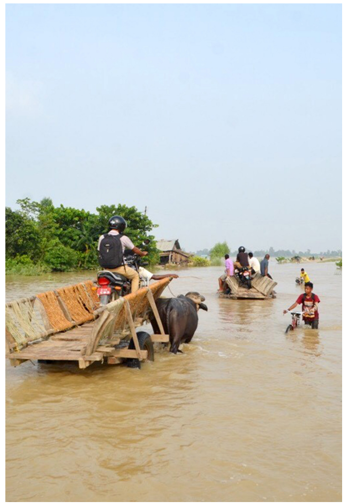
August 2017, Kailali, Nepal.

The impacts of climate change have reached crisis levels in much of the Global South. Climate-related disasters and dire environmental conditions are devastating communities, weakening critical infrastructure, threatening lives and livelihoods, and forcing millions to flee their homes in search of safety and better opportunities.<sup>1</sup>