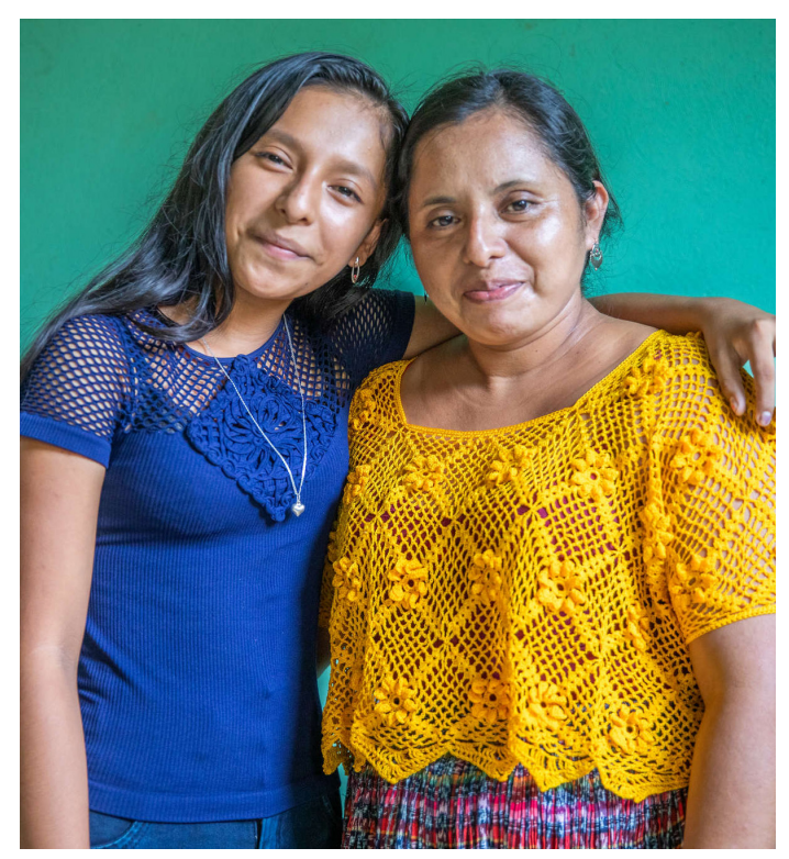
May 2023, Corozal, Guatemala.

In Colombia, for example, many end up in border towns. This migration, driven by the need to escape deteriorating conditions, including extreme drought, flooding, and political crises, frequently results in precarious living situations. These migrants, especially young men, reported making hasty decisions under high stress, influenced by a critical lack of resources and reliable information.67 At the same time, some chose to end their migration journey in unstable border towns prior to reaching their targeted destination, citing an aversion to loss after years of hardship. They expressed a significant need for accessible, reliable details on employment prospects, migration costs, and realistic