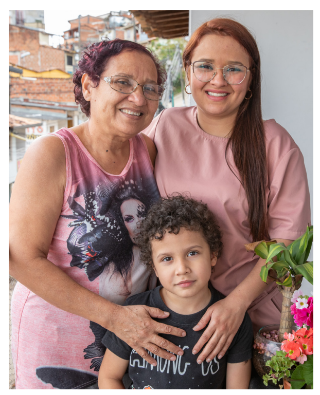
June 2022, Medellín, Colombia.