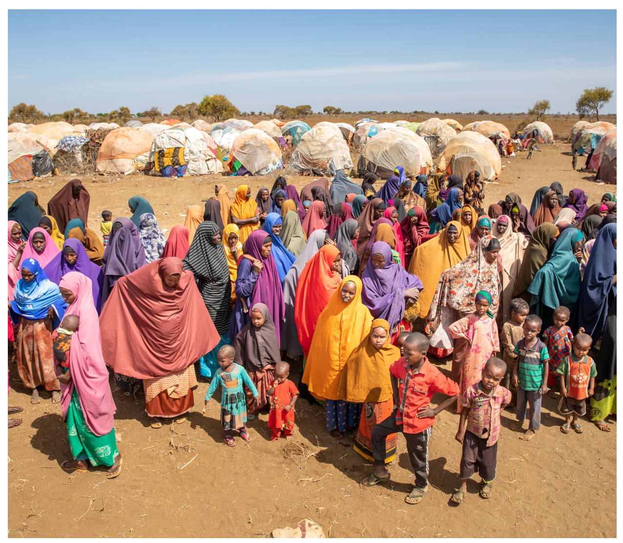
February 2022, Baidoa, Somalia.