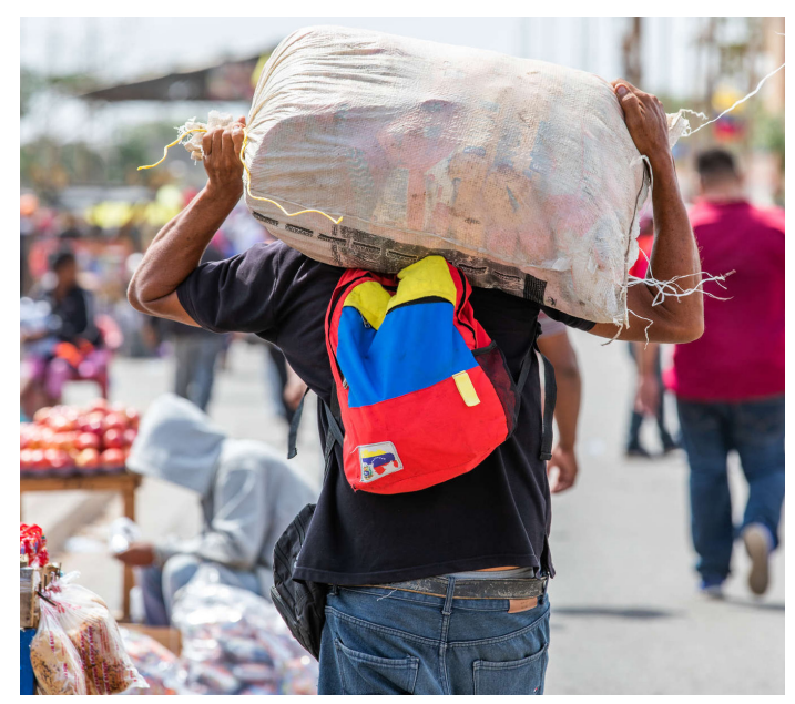
May 2019, Paraguachón, Colombia.

The effectiveness of migration as an adaptation strategy can be judged by its outcomes on migrants and others. Szaboova et al<sup>38</sup> have put forth criteria for evaluating migration as a climate adaptation strategy: To be "successful," migration must improve well-being, be equitable, and advance sustainable development goals for the migrants and wider society.