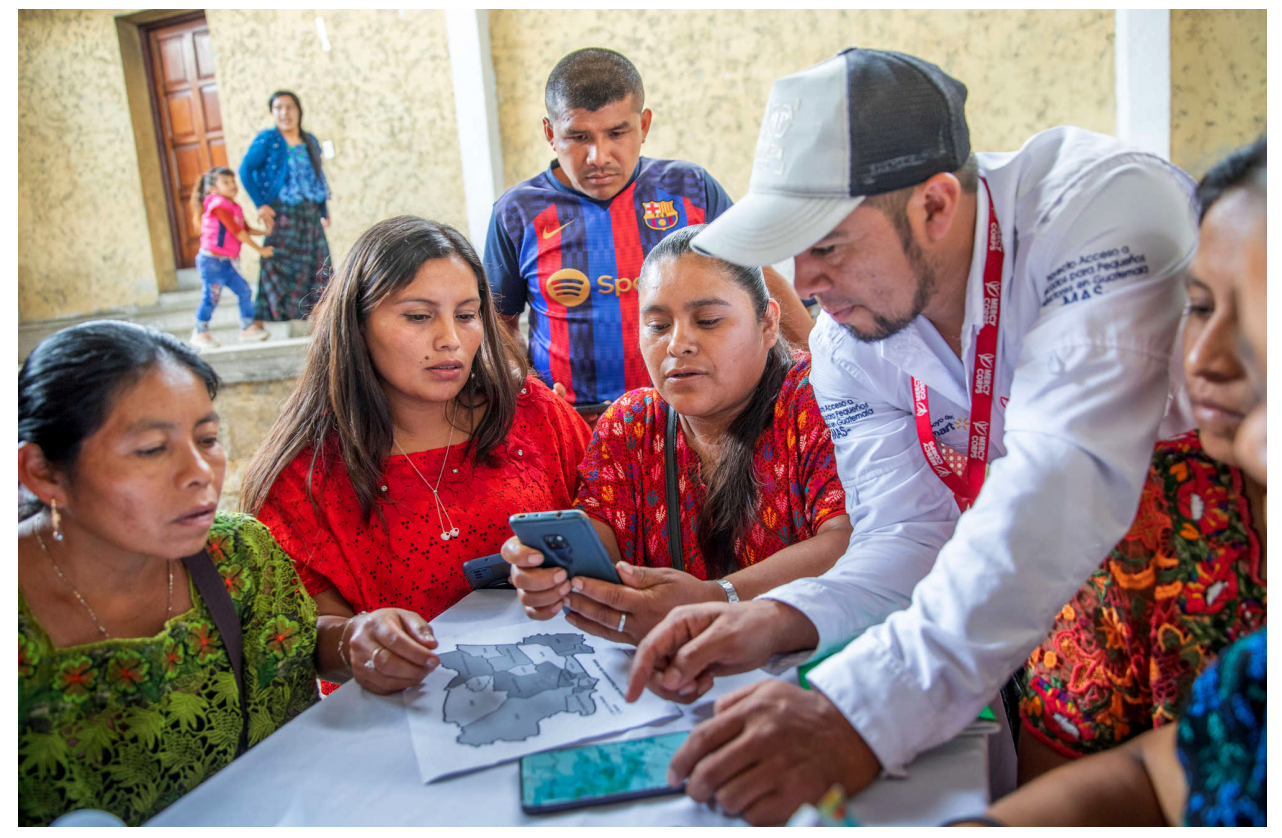
May 2023, Cobán, Guatemala.

Still, political discourse often portrays migration negatively, viewing it as a problem to be solved rather than an opportunity. This perspective influences foreign assistance strategies and policies, which