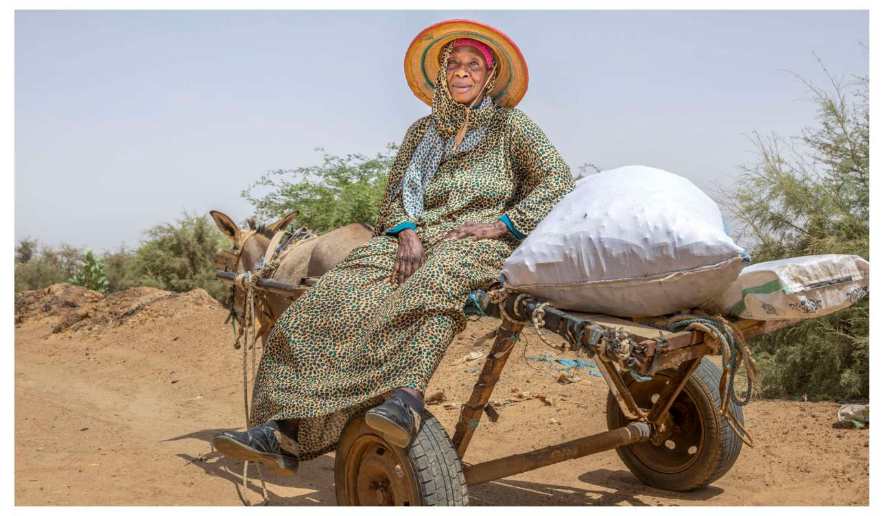
May 2024, Saint-Louis, Senegal.

As we navigate the complexities of climate change, we must embrace migration as a necessary strategy for adaptation. This document offers a new perspective beyond—and complementary to—the more traditional approach of supporting adaptation in place. Pursuing policy and programming for successful migration, we can address the urgent needs of those most vulnerable to climate change, while supporting communities of origin and destinations to adapt.