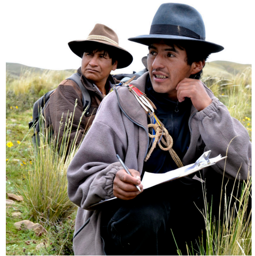
Bolivia – Jennifer Dillon/Mercy Corps

In 2009, Mercy Corps founded Red Tierras, a land network in Latin America to resolve land disputes and secure land tenure for indigenous, Afro-descendent, and/or small-scale farmers. Red Tierras achieves this objective through two primary interventions, (1) the facilitation of knowledge exchange on land issues among marginalized populations, state land agencies, non-governmental organizations and other stakeholders in Latin America; and (2) the use of innovative technological strategies to improve the transparency, inclusiveness and efficiency of land tenure resolution processes.