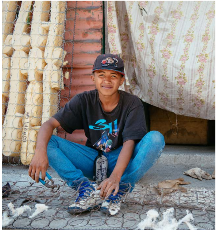
Corring Robbins / Mercy Corp.

These measures, while failing to improve conditions in countries of origin, assume that simply increasing the difficulty of migration will make people less likely to come to the U.S. Yet, the accounts of many aspiring and actual migrants indicate that this is not the case. As one young man explained, "You put yourself at risk by traveling there [to the U.S.] but he who doesn't take a risk, doesn't win."22 What drives so many people to continue to aspire to migrate, despite the risks, is a deep-rooted feeling of hopelessness. Without addressing this, policies focused on deterrence are doomed to fail, in the long-term. Indeed, despite a twenty fold increase in funding for border security since the 1990s, the undocumented immigrant population in the U.S. has ballooned from about 3 million in 1986 to 12 million in 2008.<sup>23</sup>An approach that focuses, first and foremost, on understanding and responding to the perennial drivers of migration from Central America chiefly, insecurity and economic hardships—could change the incentives for people aspiring to leave their home countries. In the next sections, we examine these two drivers in more detail and evidence on the extent to which development assistance can effectively address them.