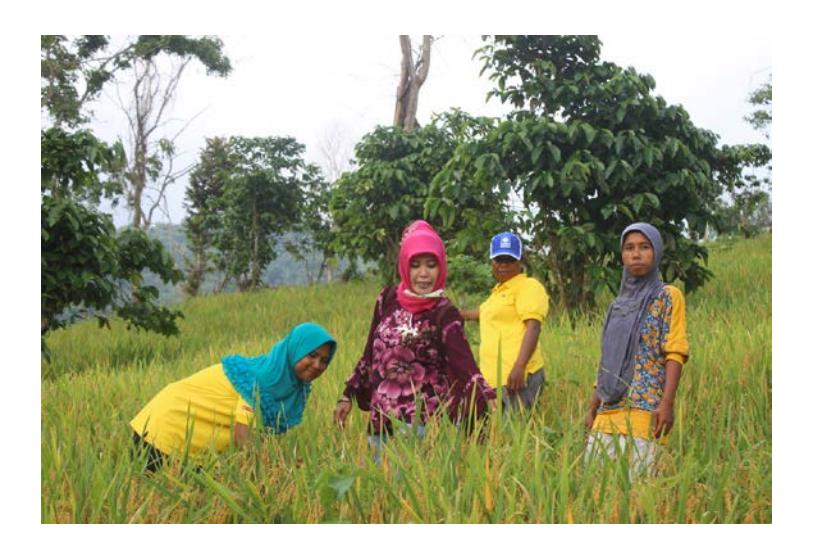
Photo #5: Bima and Dompu communities have traditionally had to protect rice fields from stormy winds and have done so by planting coffee trees. The women in these communities quickly adapt their agricultural mitigation techniques.