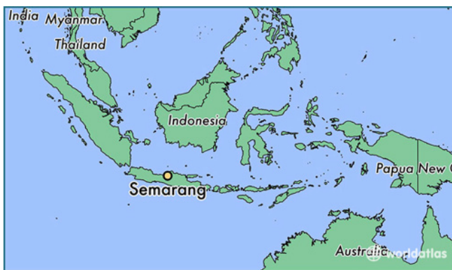
FIGURE 1 MAP OF SEMARANG, INDONESIA.

Semarang is a large port city whose economic base is related to its strategic position as Central Java’s principal gateway for exports and imports. It has grown dramatically in recent years and attracts migrants from throughout Java and beyond. Its economic base includes agro-industry and manufacturing, as well as a sizeable shrimp farming and fishing industry that has been affected by degradation of the marine environment. The city is characterized by its lush lowlands dotted with Dutch colonial buildings and dense urban neighborhoods. It is also home to mangrove forests that are vital to the health of its coastal areas and livelihoods of its people.