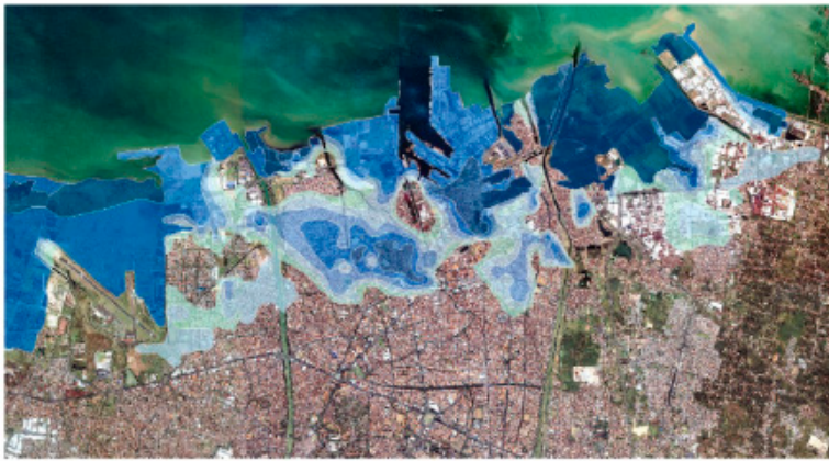
FIGURE 2: SEA WATER INUNDATION IN SEMARANG IN THE NEXT 100 YEARS. THIS FIGURE SHOWS A SIMULATION OF SEA WATER INUNDATION OVER NEXT 100 YEARS IN SEMARANG CITY. THE DARK BLUE COLOR IN THE EASTERN AND WESTERN PART OF THE CITY REPRESENTS 20 CM INUNDATION. THE LIGHTEST BLUE COLOR REPRESENTS 80 CM INUNDATION. THE BLUE GRADATION IN BETWEEN REPRESENT 40 CM AND 60 CM SEA WATER INUNDATION.

The Indonesian government is well resourced, but has a service delivery problem. At the city level, collaboration in Semarang is stunted among government agencies and civil and private sector actors. Budgeting and city planning rarely extended beyond five years, and short election cycles have made long-term planning difficult. City department officials work in silos, and few are aware of the need for coordination amongst institutions. This has led to city plans being incongruent, as decisions around water management, for example, are often made independently of decisions around city zoning or infrastructure development. Traditionally, the government has not had strong mechanisms or incentives for