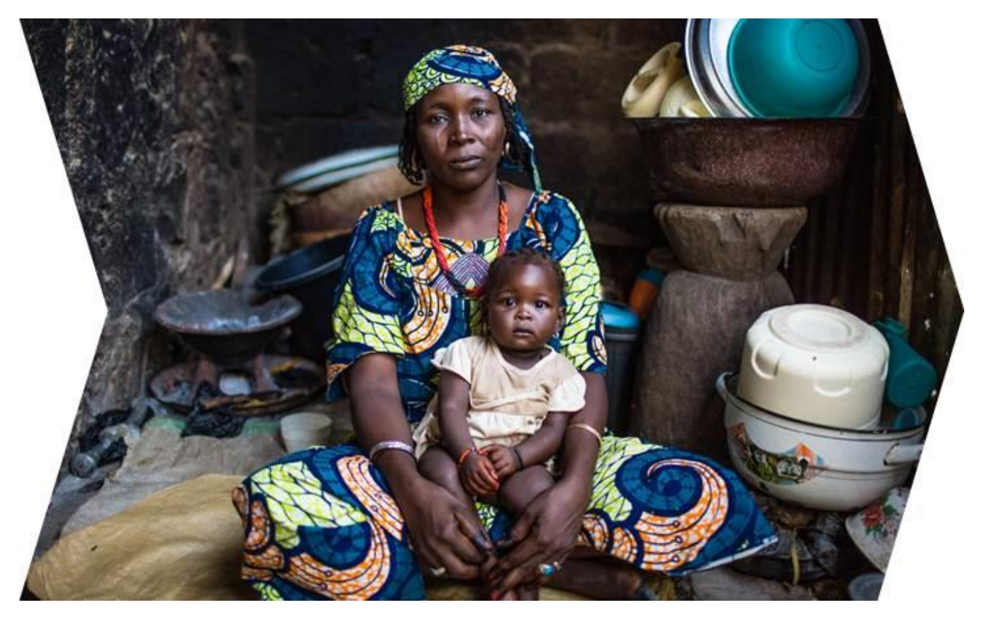
In Biu, Borno state, Nigeria, a mother and daughter live with six other family members in a one-room hut since they fled their village two years ago. They rarely eat more than one meal a day.