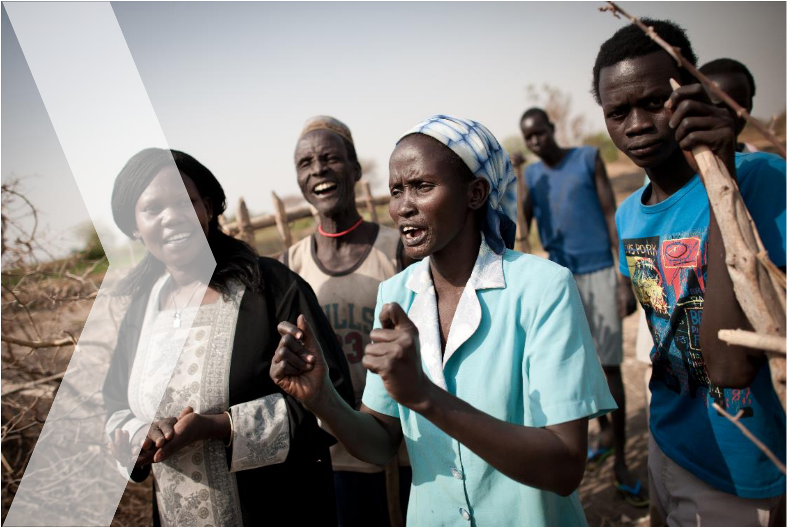
South Sudan/Mercy Corps/M Roquette