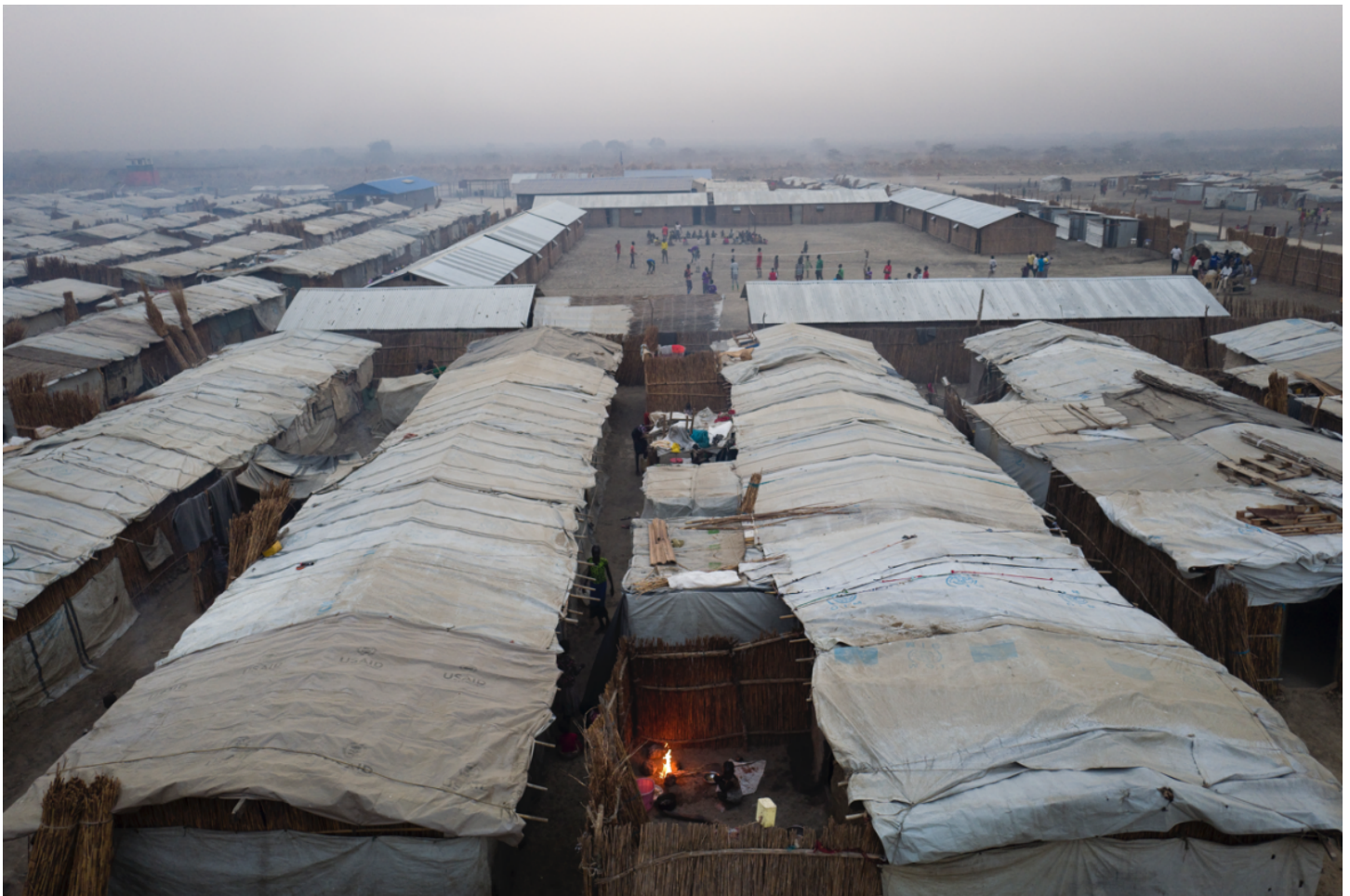
South Sudan/Mercy Corps/D Nahr

It should be noted that this research was conducted in communities that are predominantly ethnically Nuer, and many of the narratives presented in this series are deeply rooted in this unique context. While the implications of the findings in this report are relevant to audiences interested in diverse contexts in South Sudan and beyond, it is important to note that the specific narratives presented in this report may manifest differently in different contexts.