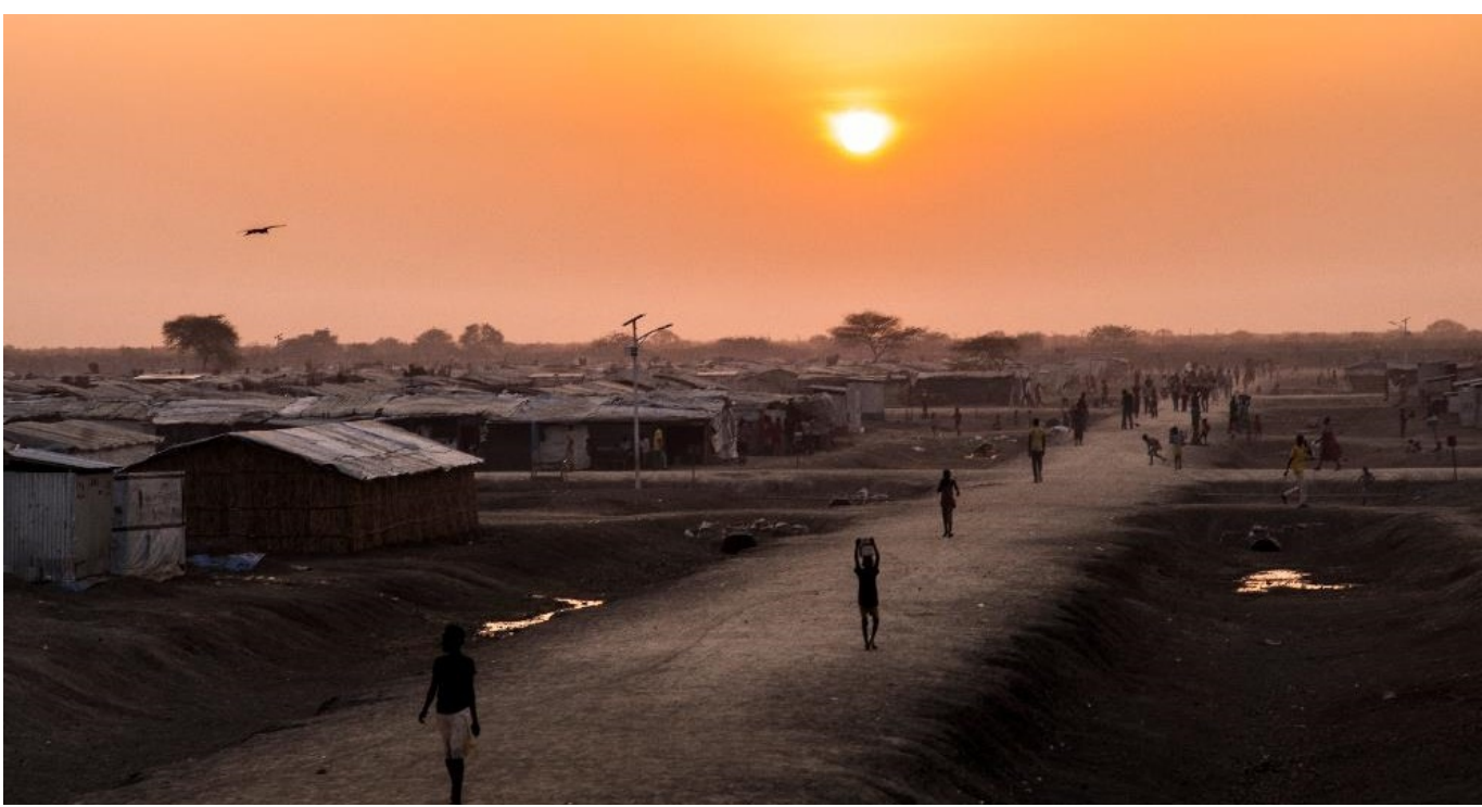
South Sudan/Mercy Corps/D Nahr