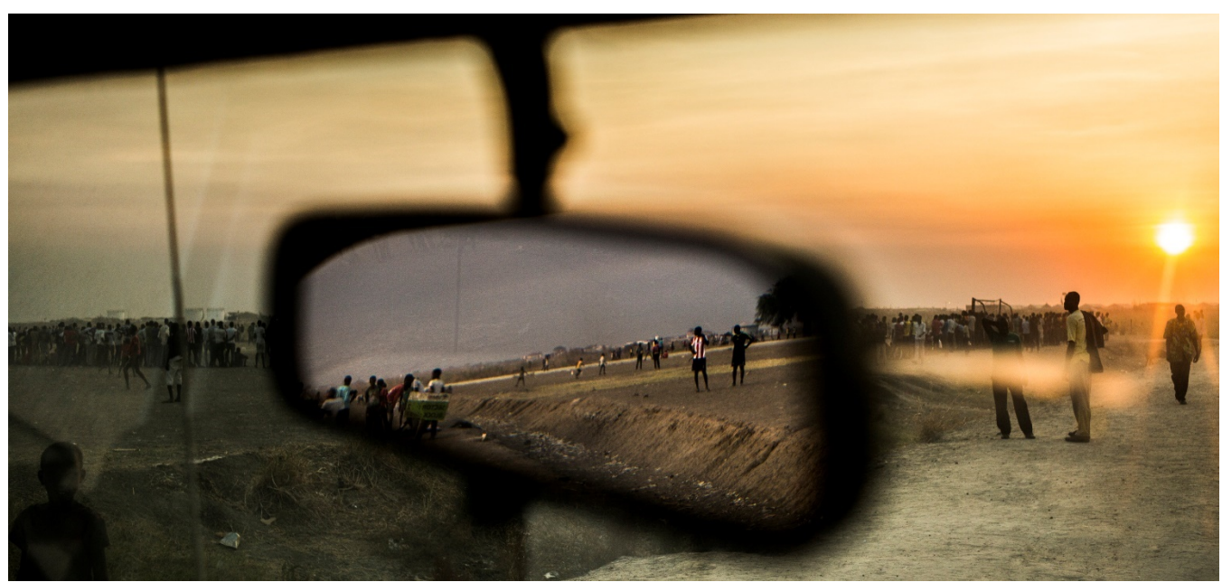
South Sudan

Some of the male elders' diminished authority is in part related to changes within youth populations in the PoC. "No youth go to the elders for consultation when they have a problem," one FGD suggested. "What happens now in the PoC is that when children have quarreled, the parents go directly to the block leader to report the case to him. He is the one to provide a solution to both sides that have quarreled. Sometimes they go to the CHC for a better solution when the block leaders have failed."81 Male elders suggest both that youth do not respect them in the PoC in the same way they did pre-displacement and that they cannot enforce their authority with youth. "If they can't listen to the UN that has guns, then how will we [elders] manage them?"82