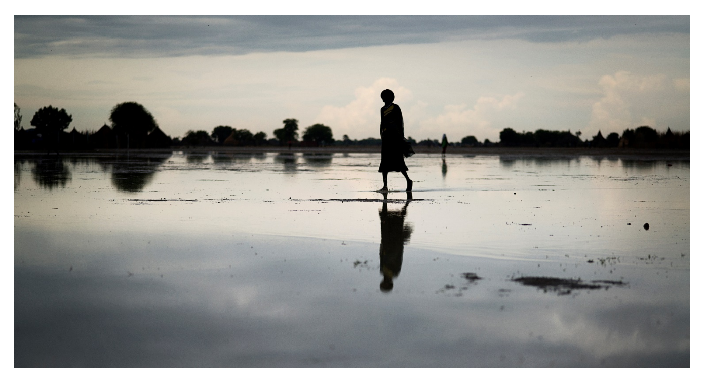
South Sudan/Mercy Corps/J Zocherman