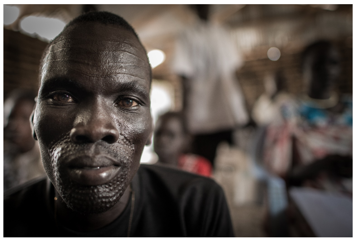
South Sudan/Mercy Corps/M Rouquette