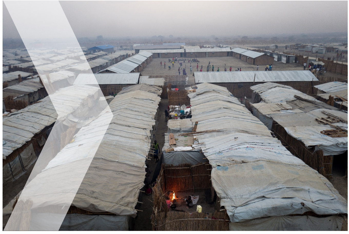
South Sudan/Mercy Corps/D Nahr