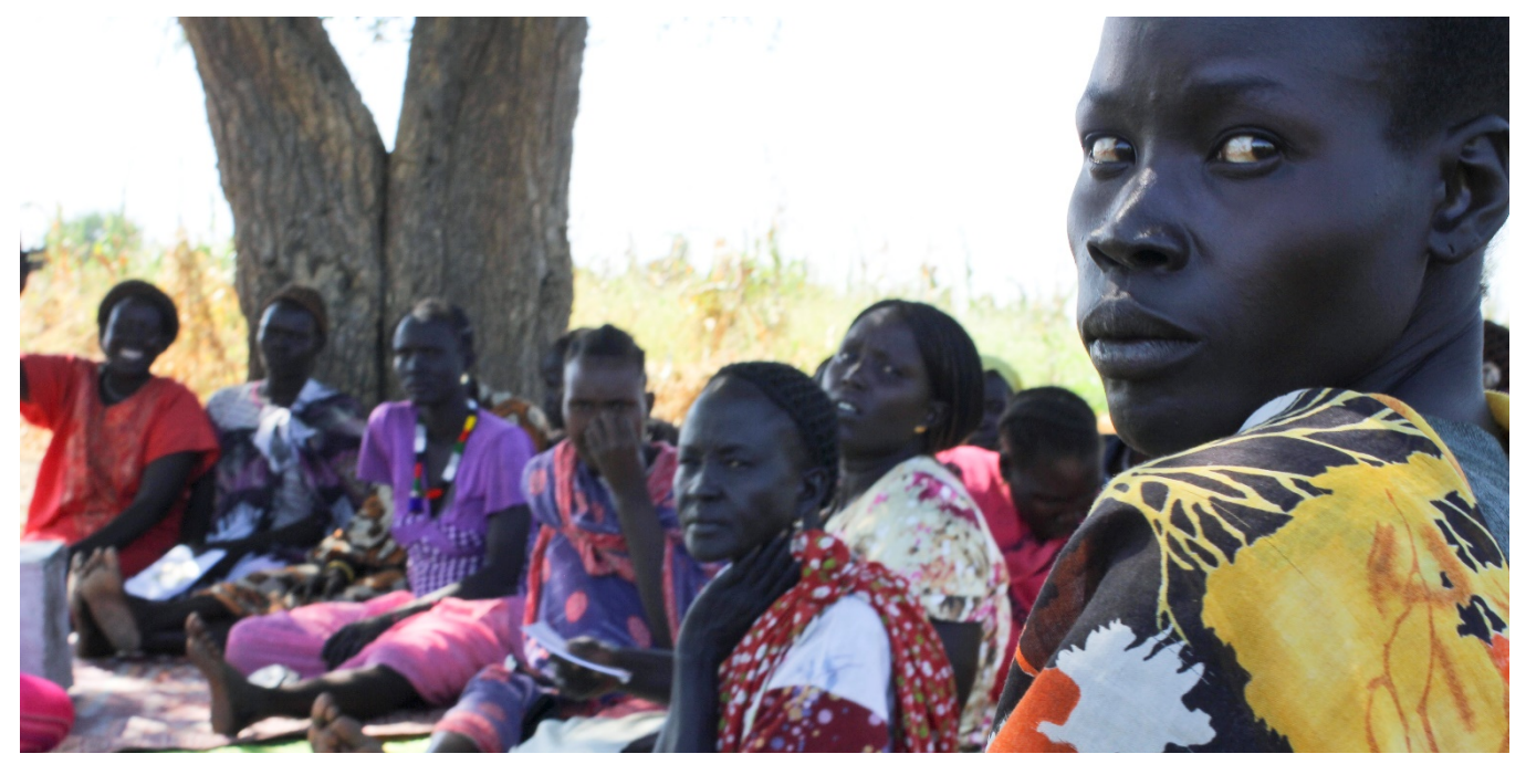
South Sudan/Mercy Corps/L Hamsik