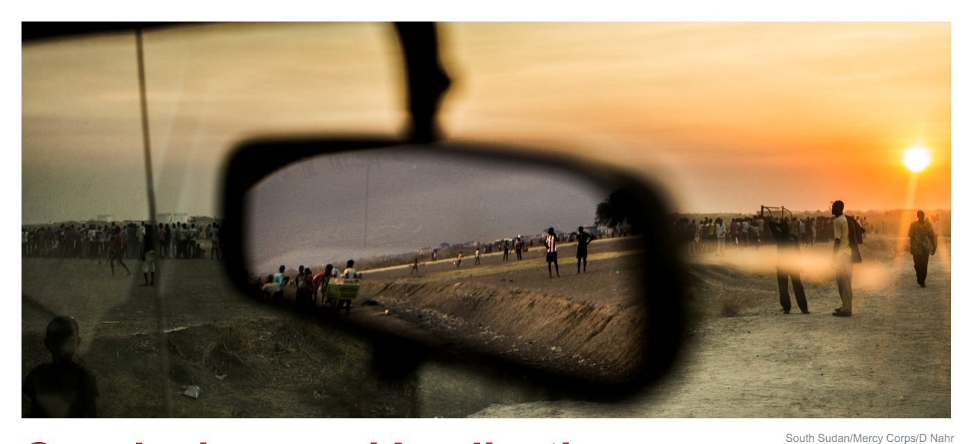
Conclusions and Implications

Informal livelihood groups have emerged as critical sources of material support and wellbeing inside the PoC. These groups have become especially important to the abilities of their members to cope and adapt during crisis because displacement has weakened kinship networks and the reliability and extent of support between kin. In addition to the economic benefits that these groups offer their members, those who have to travel outside of the PoC (such as women and traders) also benefit from the safety, protection, shared trust, and information that these groups offer.