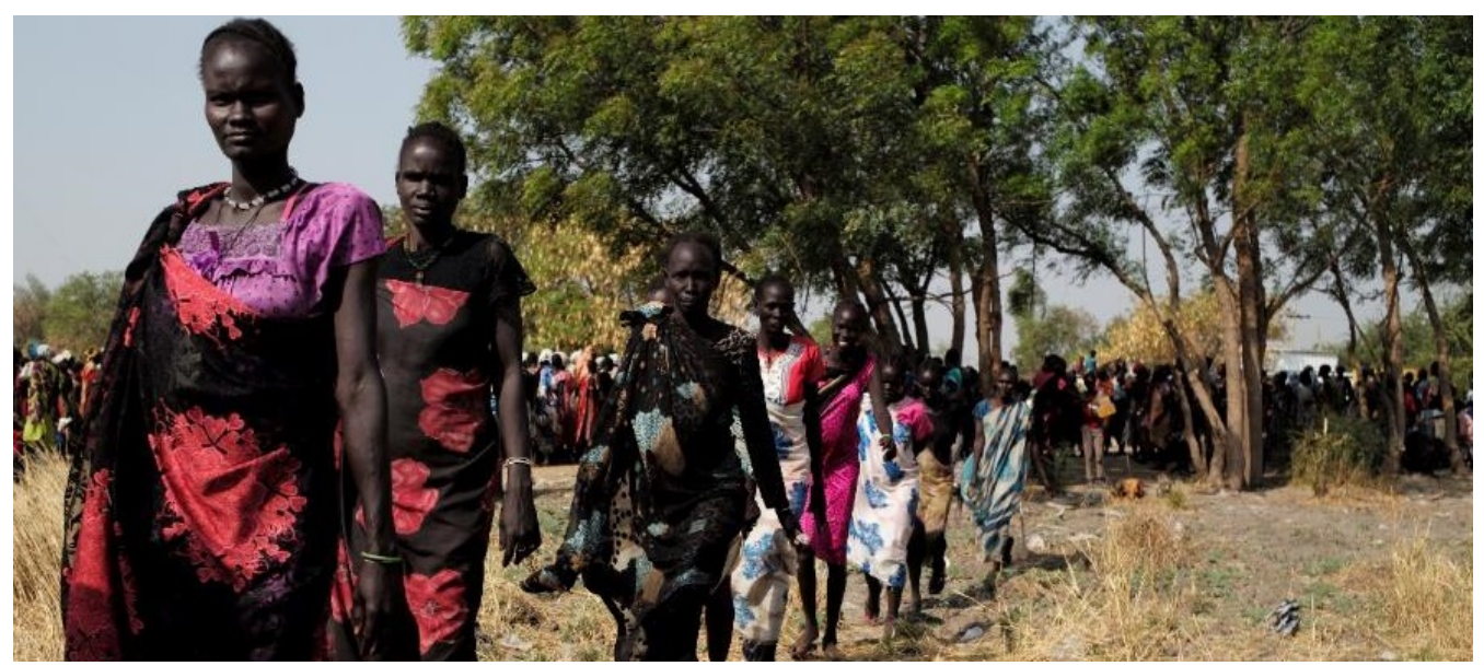
South Sudan/Mercy Corps/D Nahr