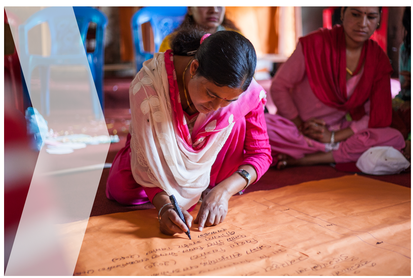
Community members from Pokhara Ward in Nepal's Rukum District take part in an integration planning exercise.