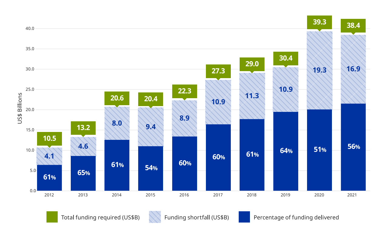
Figure 3: Funding received and unmet requirements of UN-coordinated humanitarian appeals