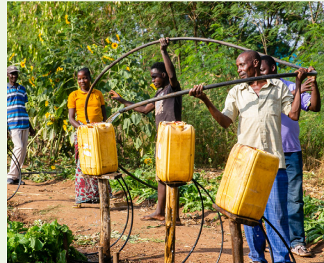
August 2023, Geita Region, Tanzania. Mercy Corps

By applying evidence-based approaches to programs and initiatives that promote solar-pumping solutions, new irrigation