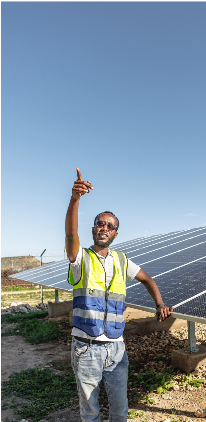
May 2024, Sheder, Ethiopia.