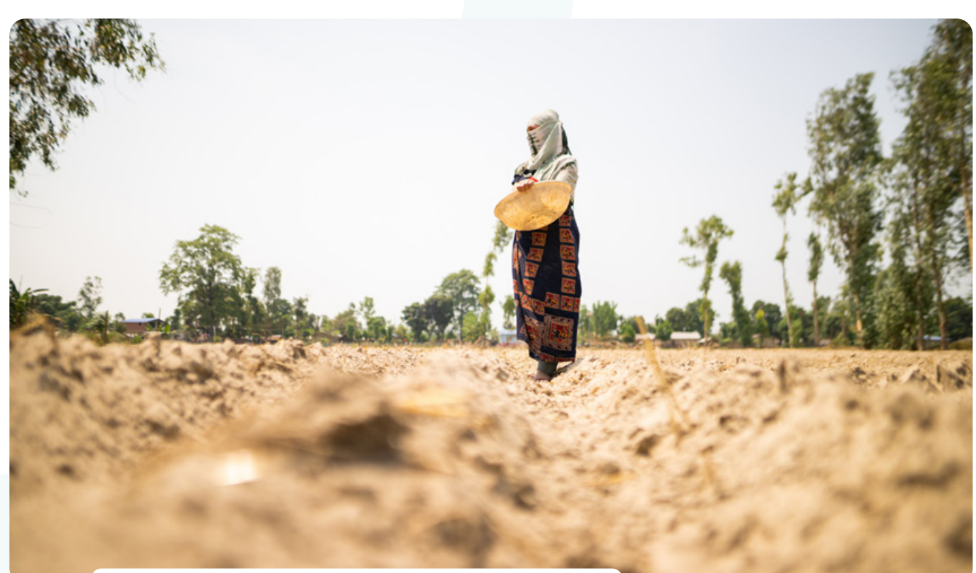
A farmer in Sudurpashchim Province, Nepal, pauses during a period of intense heat.