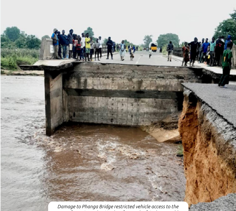
Damage to Phanga Bridge restricted vehicle access to the town of Nsanje, Malawi in the aftermath of Cyclone Freddy.

The legally binding 2015 Paris Agreement is of particular significance because it underpins the NCQG. Articles 2 and 9 of the Paris Agreement set out the core role of finance in driving climate action and create an obligation for developed countries to provide financial resources to developing countries. If countries are to interpret their treaty commitments in good faith, this obligation cannot be ignored. Indeed, as the second IHLEG report on climate finance put it: "Failure to generate investment and finance of the scale and nature required is to fail on Paris. The consequences would be devastating, particularly for the poorest people. Seizing the opportunity would unlock the growth story of the 21st century" (Bhattacharya et al., 2023).