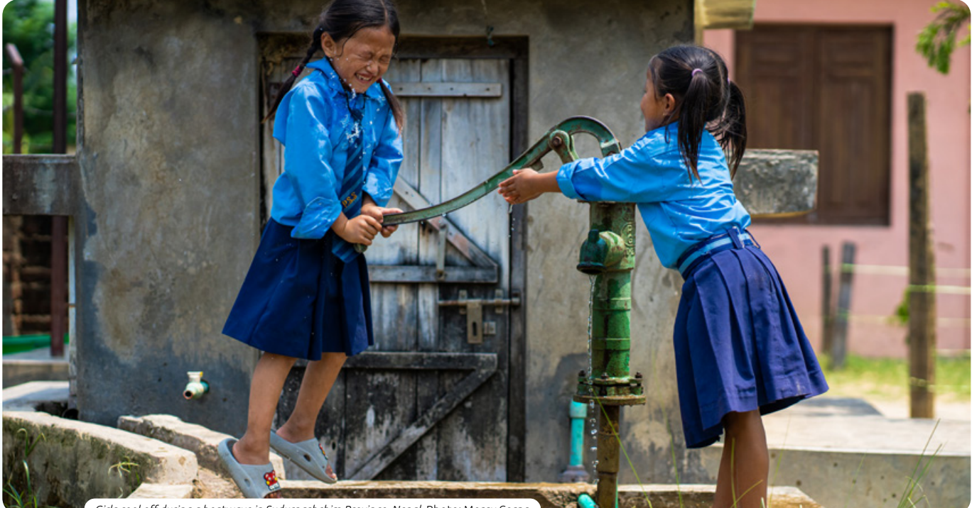
Girls cool off during a heatwave in Sudurpashchim Province, Nepal.

Achieving this is in the interest of all countries. It would restore trust in international climate negotiations, and give developing nations the support they need and have the right to under the UNFCCC. It would help put the whole world on a safer track towards a more stable climate and economy. And it would save lives, and restore some hope and dignity for communities around the world who are on the frontlines of the climate crisis.